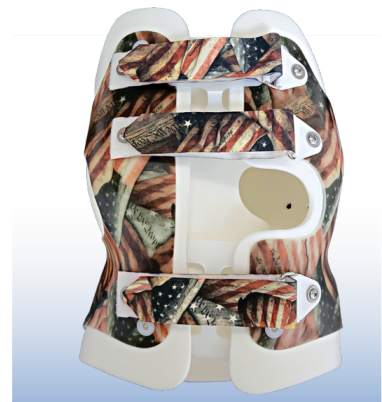
Soft TLSO Anterior Opening w/ External Frame (Soft Body Jacket)