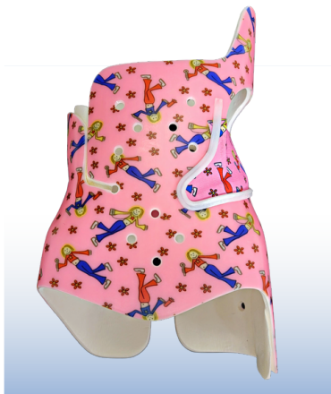
A Full Time Scoliosis Brace