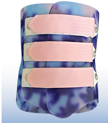
Anterior Overlap Brace