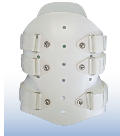
A Bivalve Overlap Brace