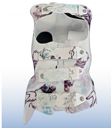
Cheneu Rigo Brace